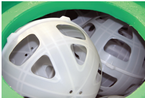
View through tank lid