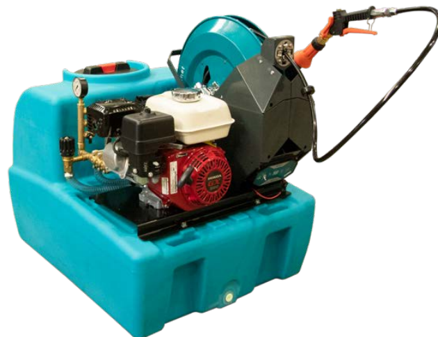
Buddy Marshal Disinfectant Sprayer PCU1885