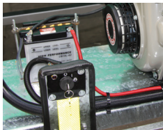
Flashing light for safety