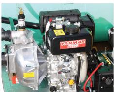
Electric start – Petrol or diesel