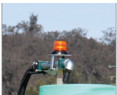
Tank level kit