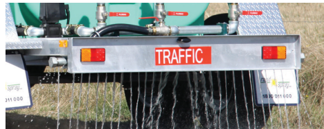
Dust suppression bar