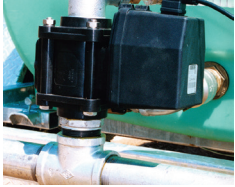
Remote controlled actuator