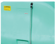
E-Stop safety kit